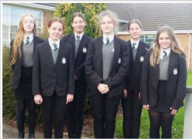
A few of the team members.